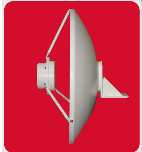
9525 Antenna Model Frequency Range: 1.5 - 2.5 GHz